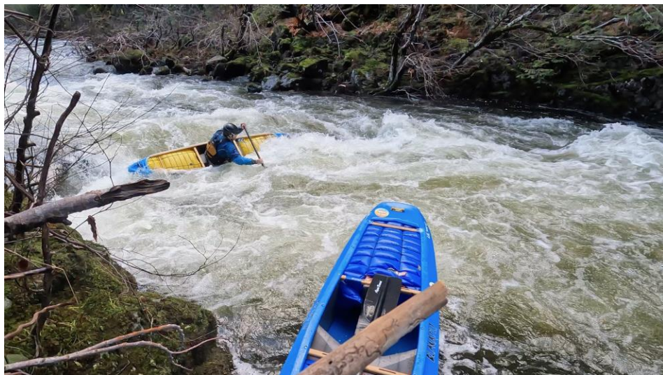
Greg and Zak in their Silver Birch Converts