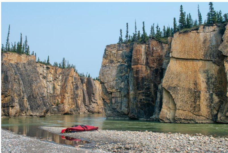
Scenic: Dan Burnett

The winners of the photo contest are here: