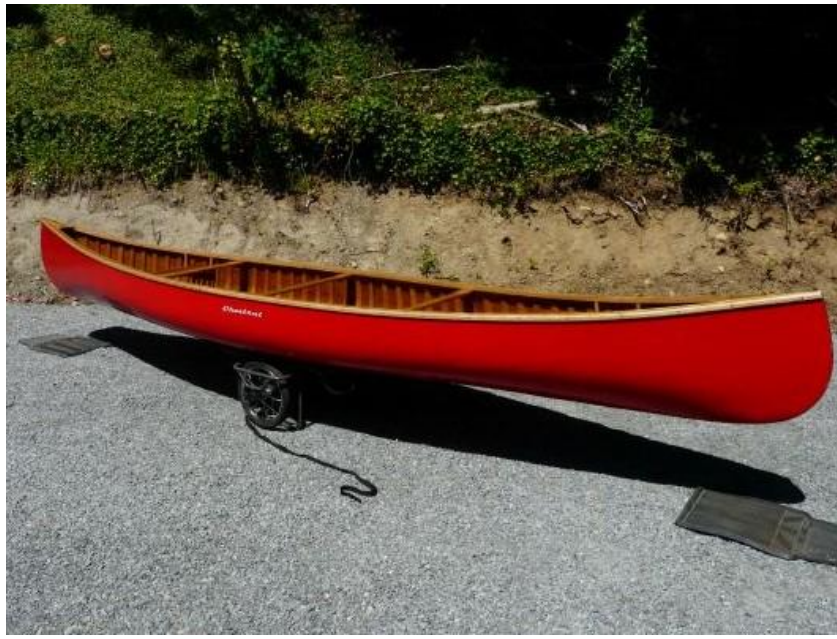
18' Chestnut Prospector (circa. 1960's – 70's)

Some may wonder why I've used the word "restorations" versus "repair" in the title of this article. For me it's about perspective, I look at these canoes as sentimental pieces from a recently past era. During that period damaged boats would have been repaired for regular service. Today many of these boats that are 60+ years old, are restored for a second life of less rigorous use and an added measure of care for them as they have reached the prestigious age of "antique" (similar to me – minus the prestige). In this three part article I will share with you my interest in this hobby, my new experiences, and the community around heritage canoes; perhaps it will spark an interest in you as it has in me.