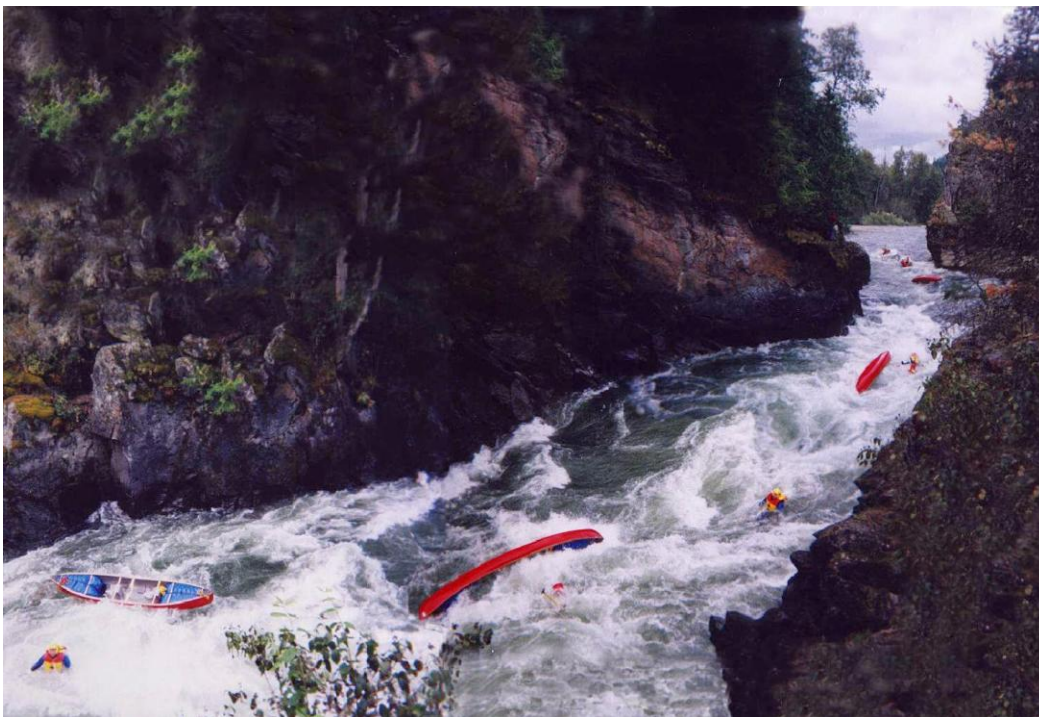
(The Adams' Canyon, Brian Otter photo-shopped – carnage not usually this extreme!)

Camping is not included, however, a suggested camp ground is to book at R & G Lewis camp about 1.5 km down from take out -- right across the road from Roderick Haig