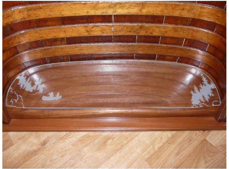
Etched glass base