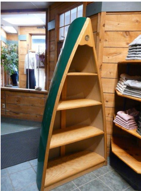
Commercial fiberglass Unit

From the above title I suspect you can see where this is headed. I have seen quite a number of these units and admired them but... when I see them made from cedar canvas canoes, invariably they are finished in a "rustic" look, meaning there is no canvas on the hull and most, if not all, the attractive features like brass stem bands, deck mount anchors or even brass screw heads are not present or at least made presentable. This has always seemed like incomplete work to me since, one, they are very expensive and, two, the external surface of the wood planking is not really the nicest part of these canoes. The canvas cover, when nicely finished, can really beautify the look. I just can't get excited about a coat of varnish on the unfinished planking.