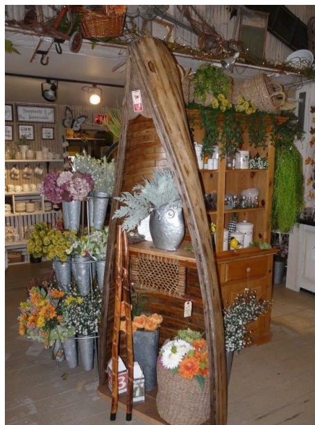
Partially complete cedar canvas