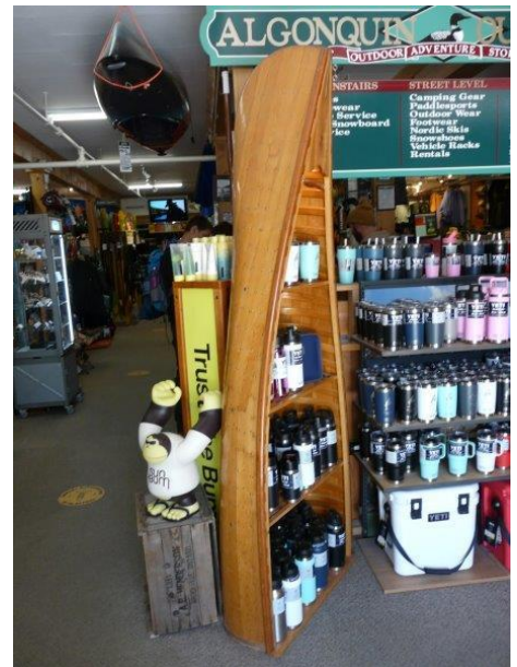
Commercial production shelf

To that end, I sought out an unwanted cedar canvas canoe. I was happy when a member of the club contacted me about taking an old canoe from his property that was given to him, but he never used it much, and he did not want it repaired. I looked at the boat, it was between 50 and 60 years old, there was extensive rot and considerable damage from tree branches that had fallen on the exposed hull over the course of many years stored beneath the large conifers. As with 99% of these boats it was repairable if that was the wish. However, it seems that unless