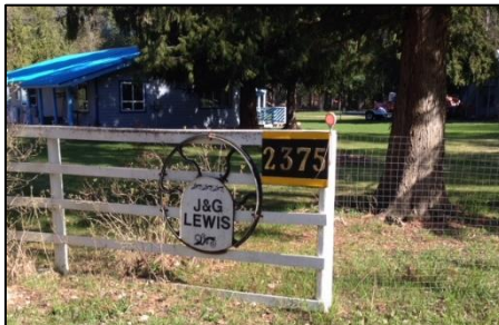
Beaver Canoe Club